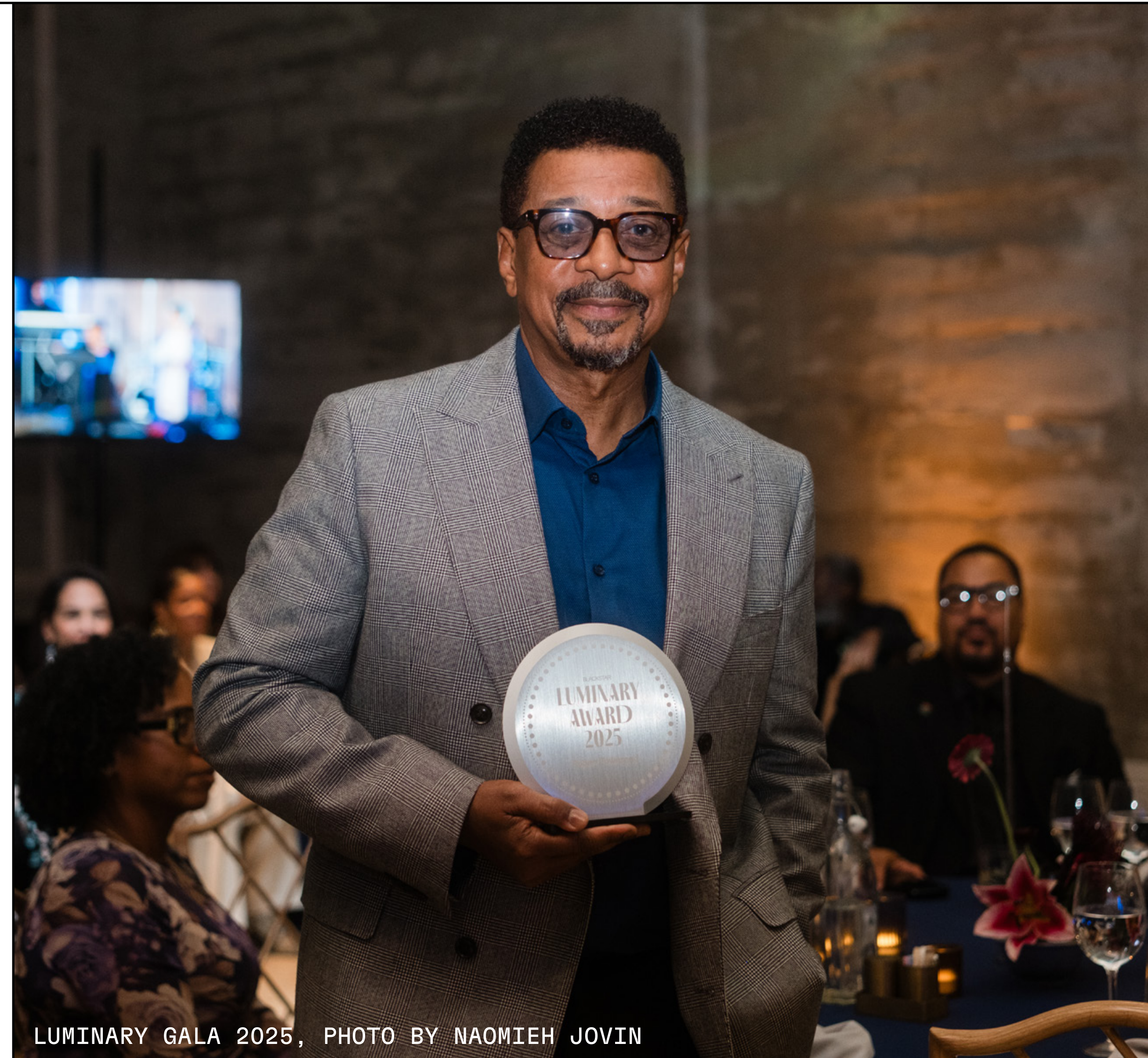
LUMINARY GALA 2025