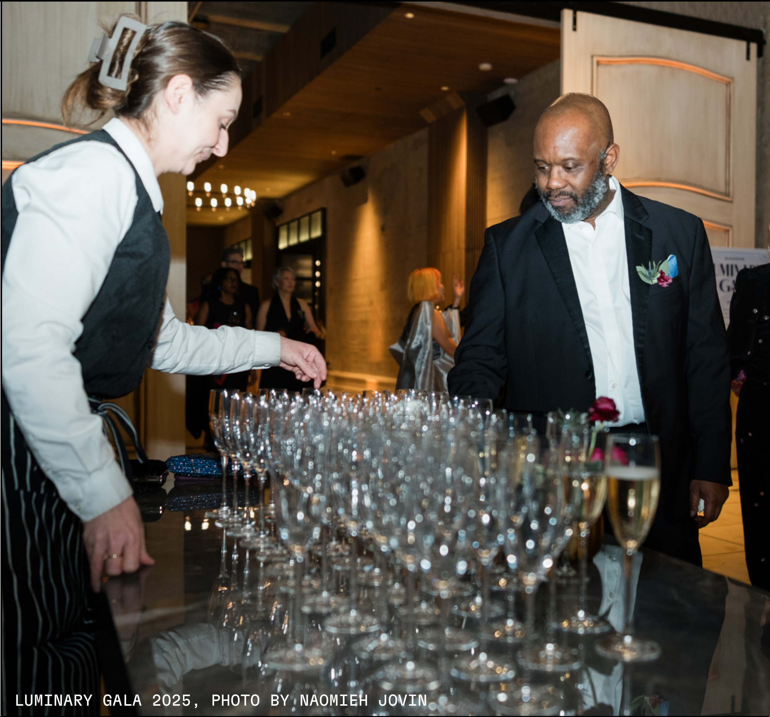
LUMINARY GALA 2025