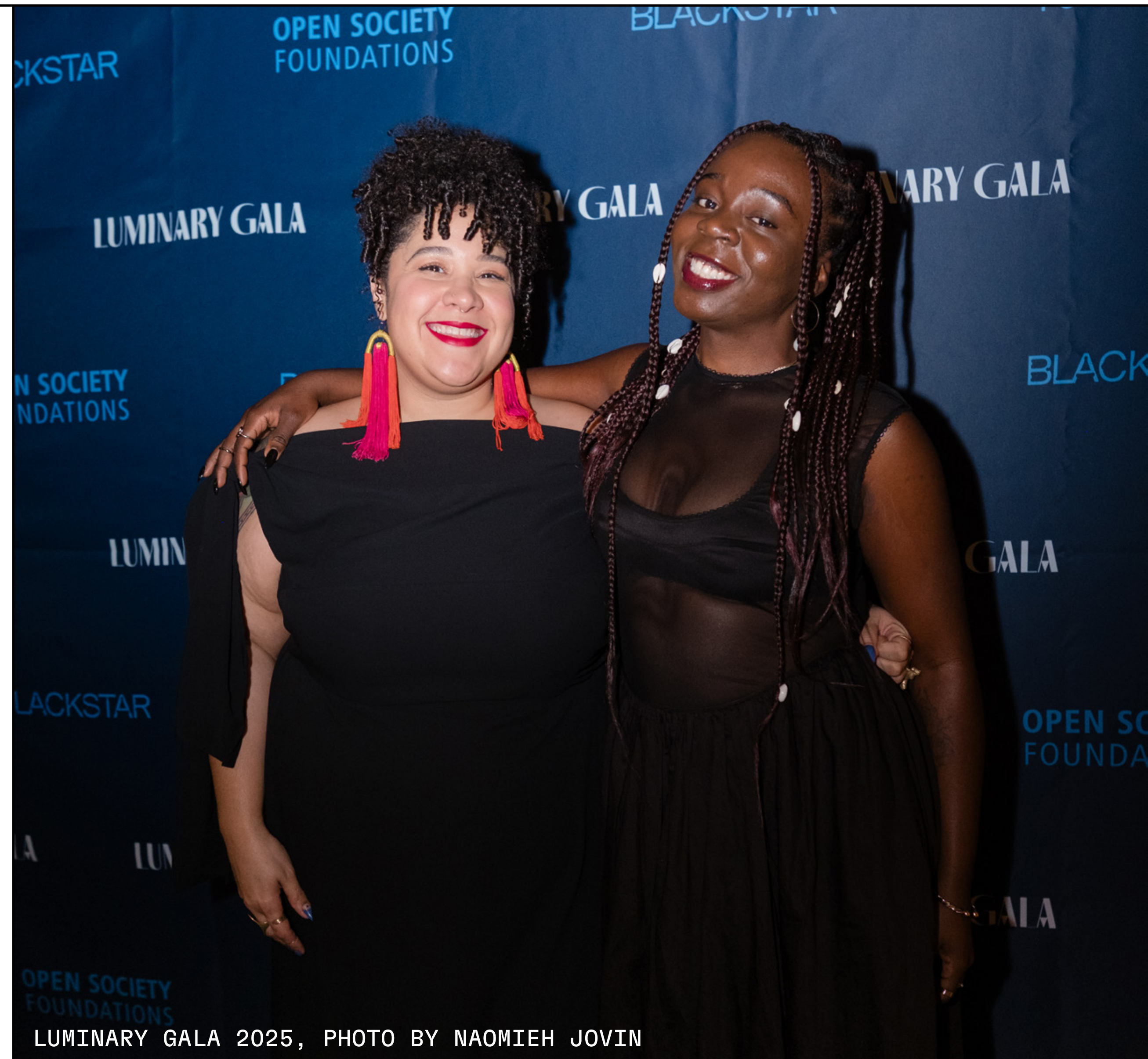
LUMINARY GALA 2025, PHOTO BY NAOMIEH JOVIN