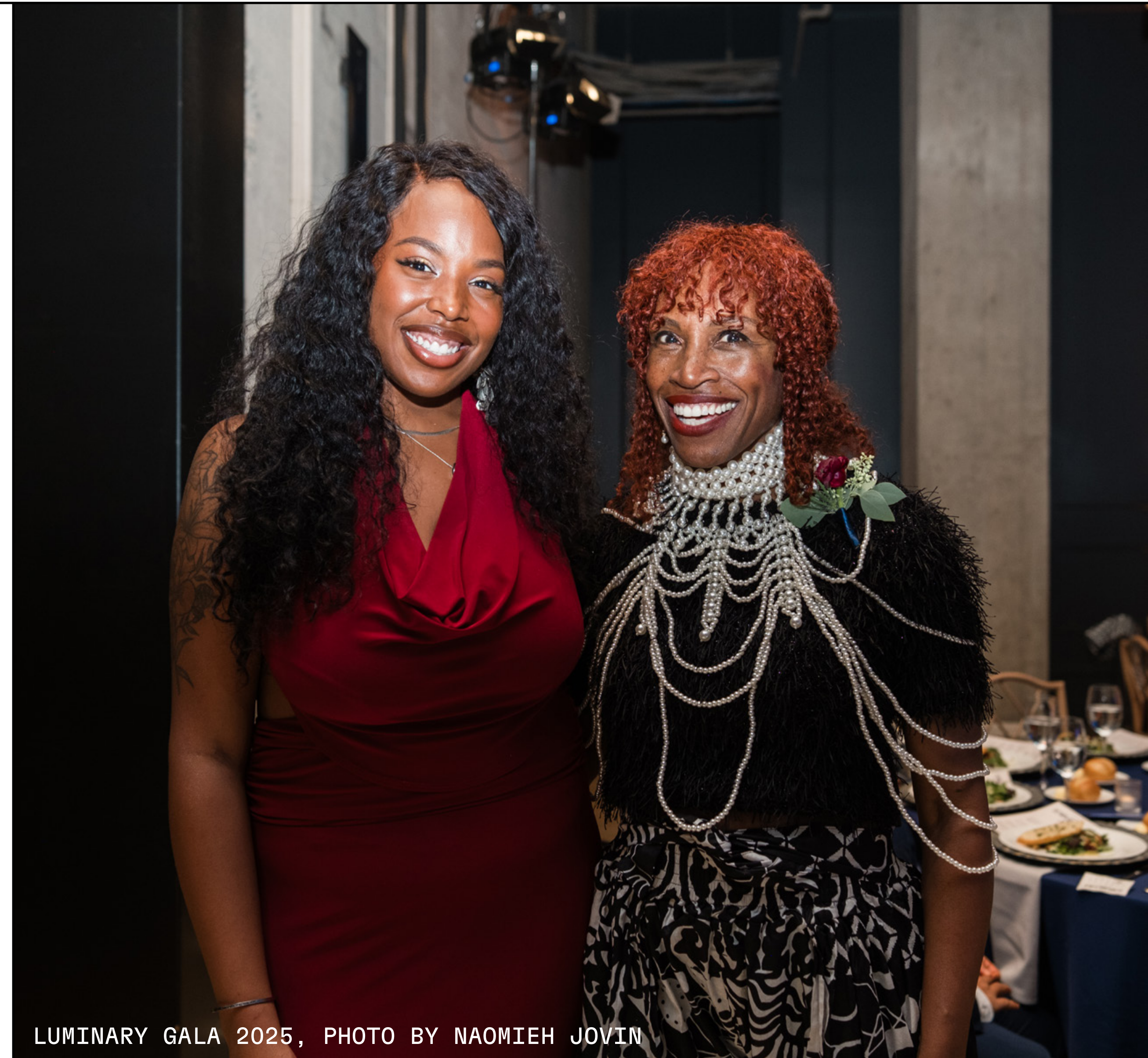
LUMINARY GALA 2025

As BlackStar's premier fundraising event, the Gala raises essential resources to support our year-round programs, which empower Black, Brown, and Indigenous artists in the moving image field.