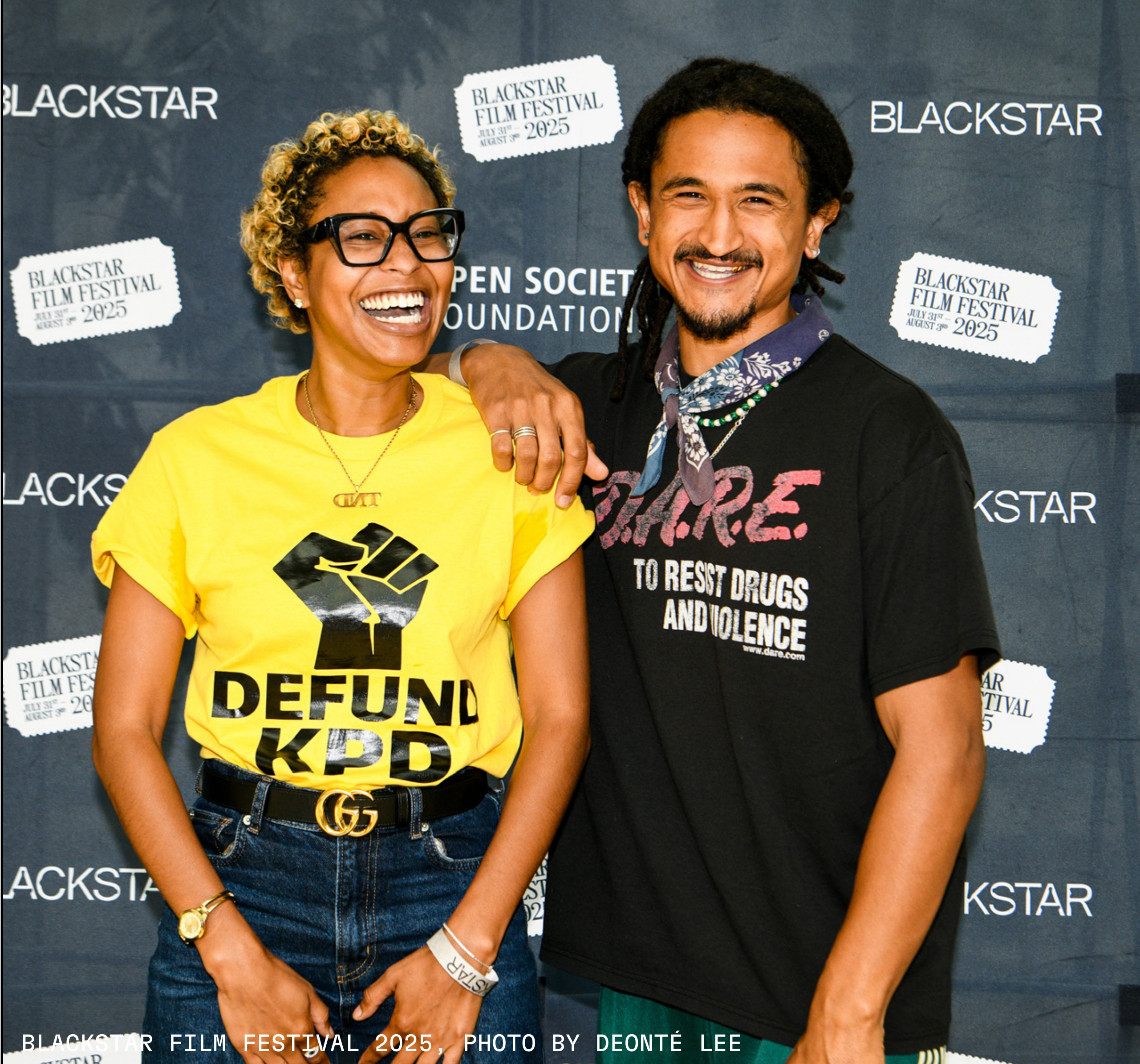
BLACKSTAR FILM FESTIVAL 2025

BlackStar views cultural production as a key tool in addressing historical inequities for Black, Brown, and Indigenous artists. By creating opportunities for economic growth, creative expression, and community building, we focus on cultural healing and relational repair. We measure our impact through both qualitative and quantitative data, tracking the direct support we provide to filmmakers from these communities, the accessibility of our programs, and the strength of our partnerships with like-minded organizations in the arts, culture, and social justice sectors.