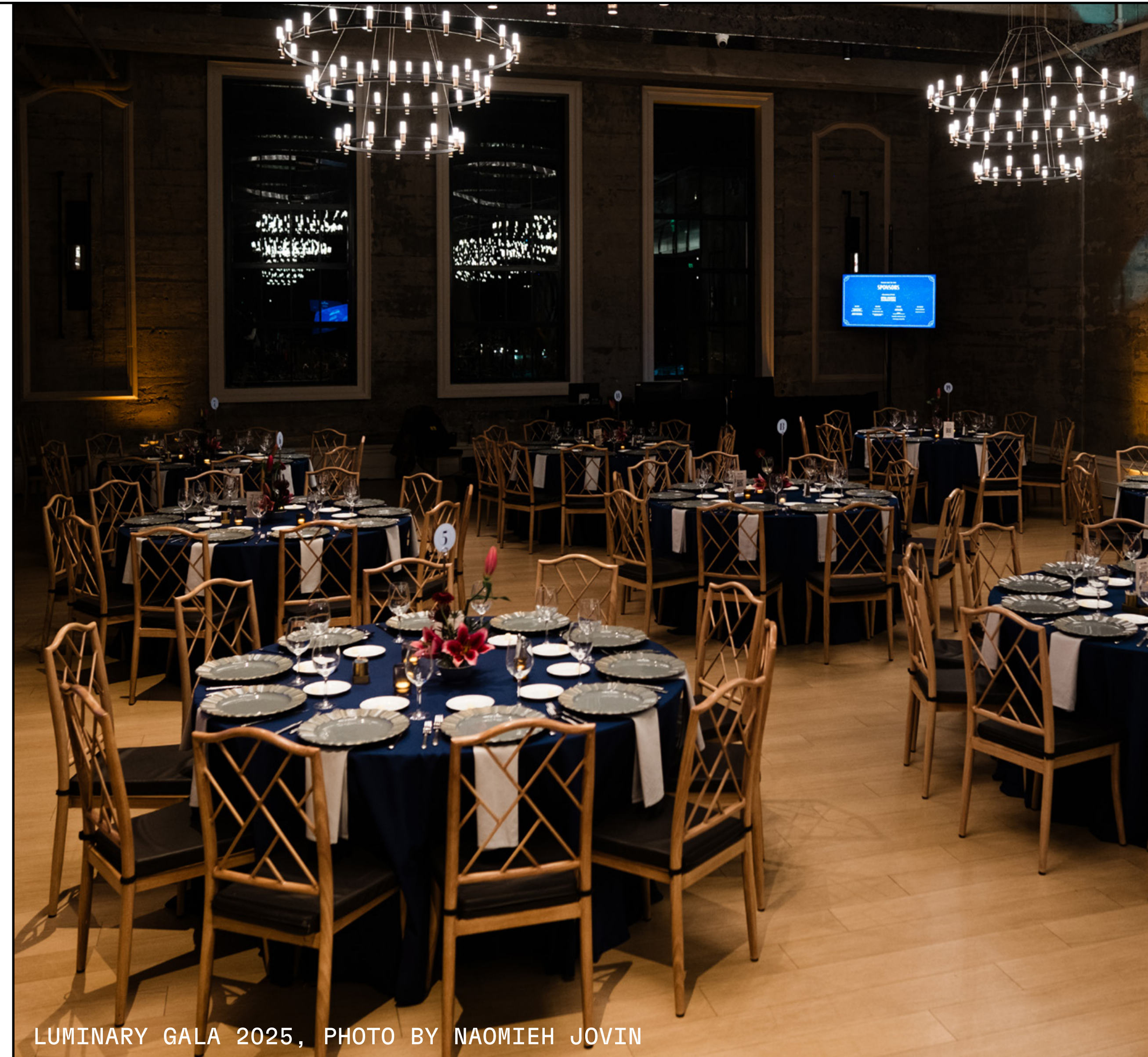
LUMINARY GALA 2025, PHOTO BY NAOMIEH JOVIN