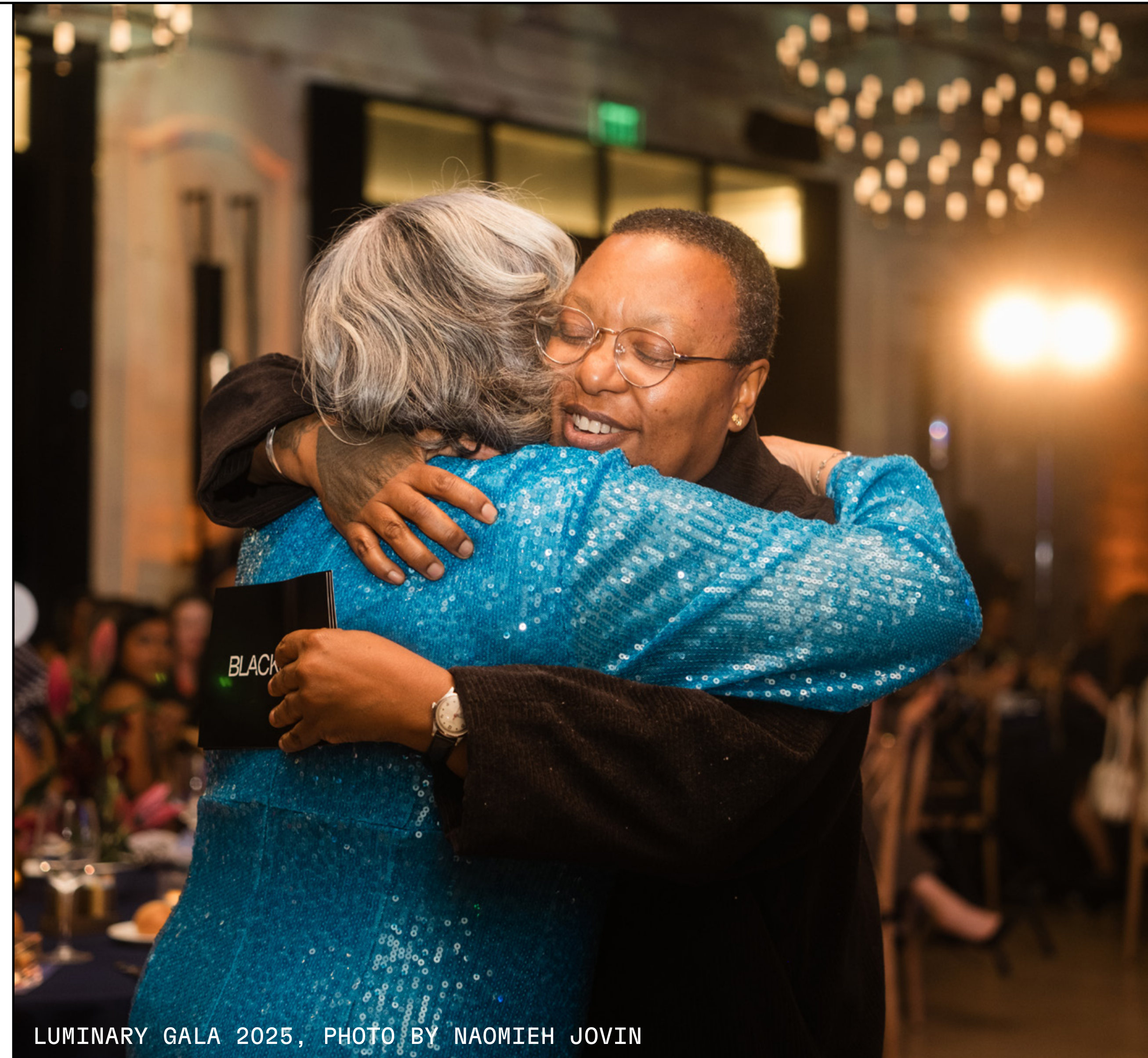
LUMINARY GALA 2025

At BlackStar, we tackle these challenges with a thoughtful, strategic approach to programming, organizational structure, and partnerships with like-minded individuals, businesses, and nonprofits. Your sponsorship enables us to continue this vital work.