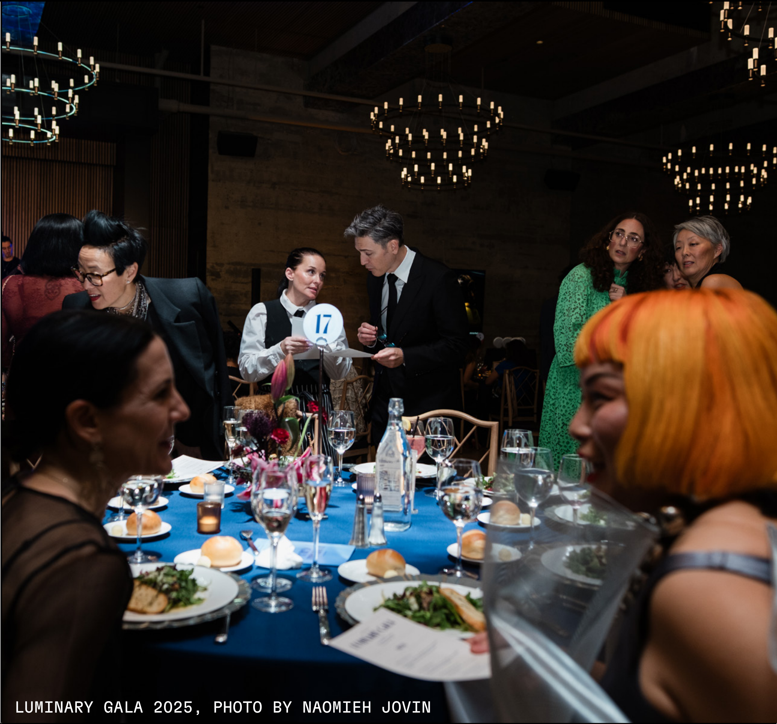
LUMINARY GALA 2025, PHOTO BY NAOMIEH JOVIN